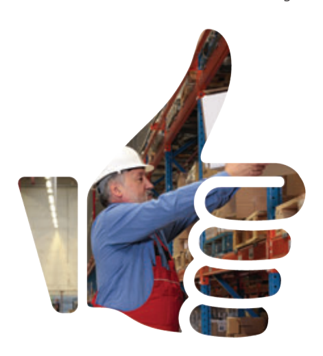
Visit www.hsa.ie for more information or log onto www.besmart.ie