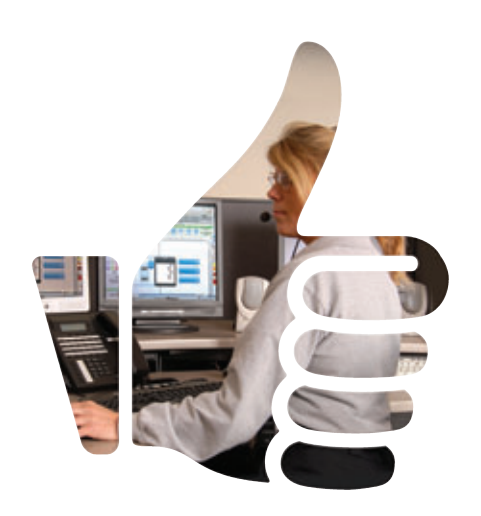
Visit www.hsa.ie for more information or log onto www.besmart.ie